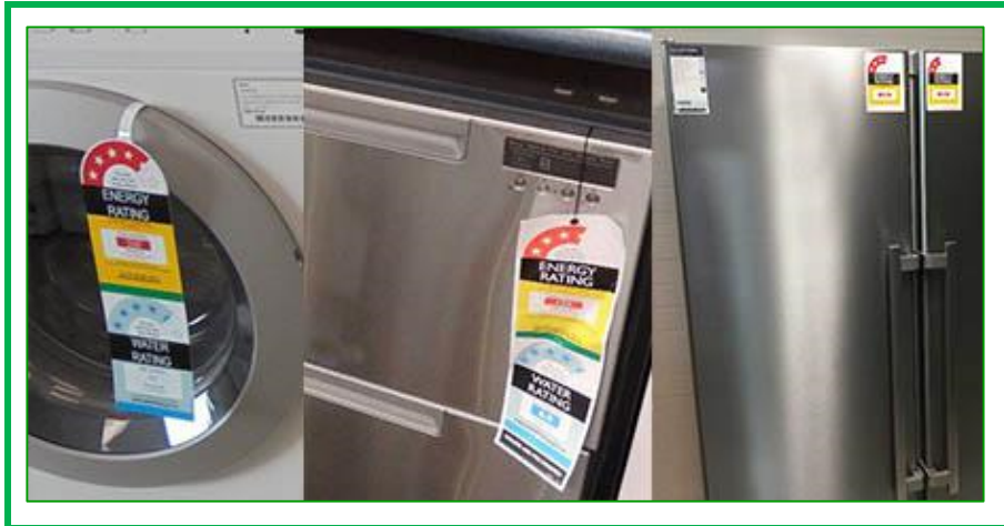
Examples of Energy Rating Labels correctly displayed