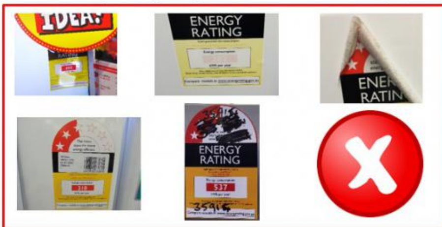
Examples of Energy Rating Labels that do not meet labelling requirements

Obscured or damaged Energy Rating Labels do not meet labelling requirements and will need to be replaced.